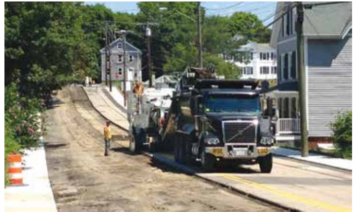
Pavement reconstruction on Morgan Street in July 2016.

The execution of a Pavement Management Project is underway. We have completed pavement inspections of all 110 centerline miles of the Town's roadways. This inspection included a collection of data such as cracking, rutting, and potholes, identified by